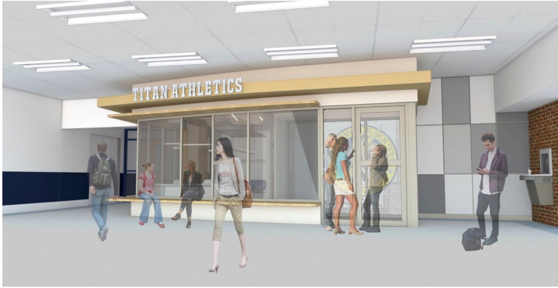
ARCON GBS Athletic Office Glenbrook High School District 225 Project No. 18126