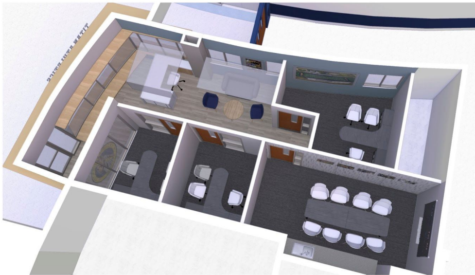
ARCON GBS Athletic Office Glenbrook High School District 225 Project No. 18126